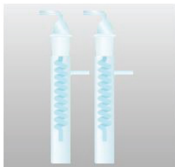
SOV Condenser AC99-007-0011SN