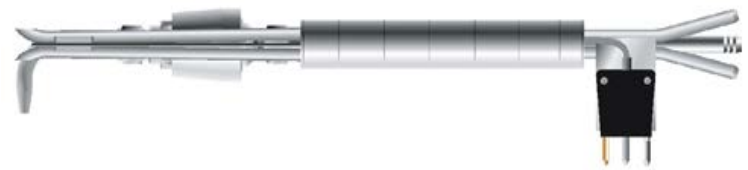
Ministack Isokinetic Sampling Kit: P/N AC99-104-0000KP